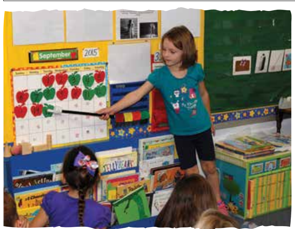
At Oregon-Davis, we encourage our students to get involved, try something new and possibly discover a life-long passion.