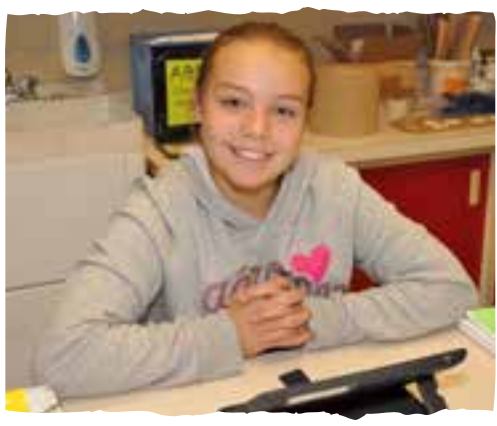
There is something to smile about at Oregon-Davis Elementary!