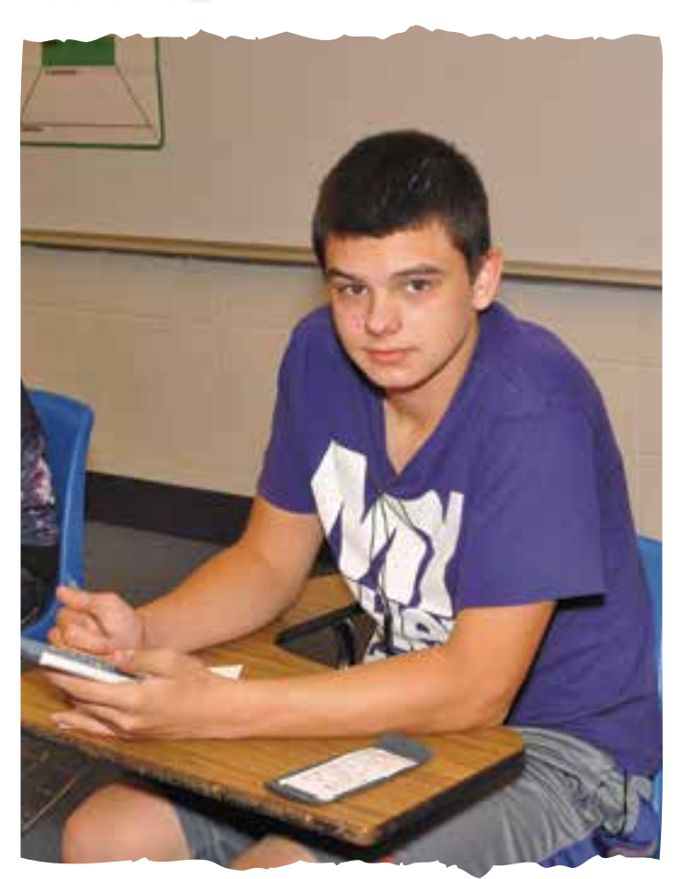
At Oregon-Davis School Corporation, we strive to prepare students for success in a changing world and give them opportunities for a lifetime of learning.