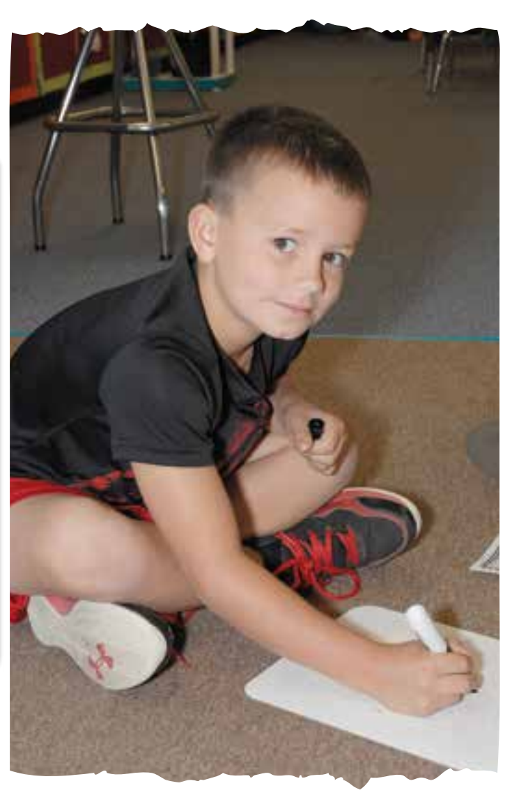
Quality education means not only putting students first, but giving them the best tools for their success and encouraging them to do their best each day.