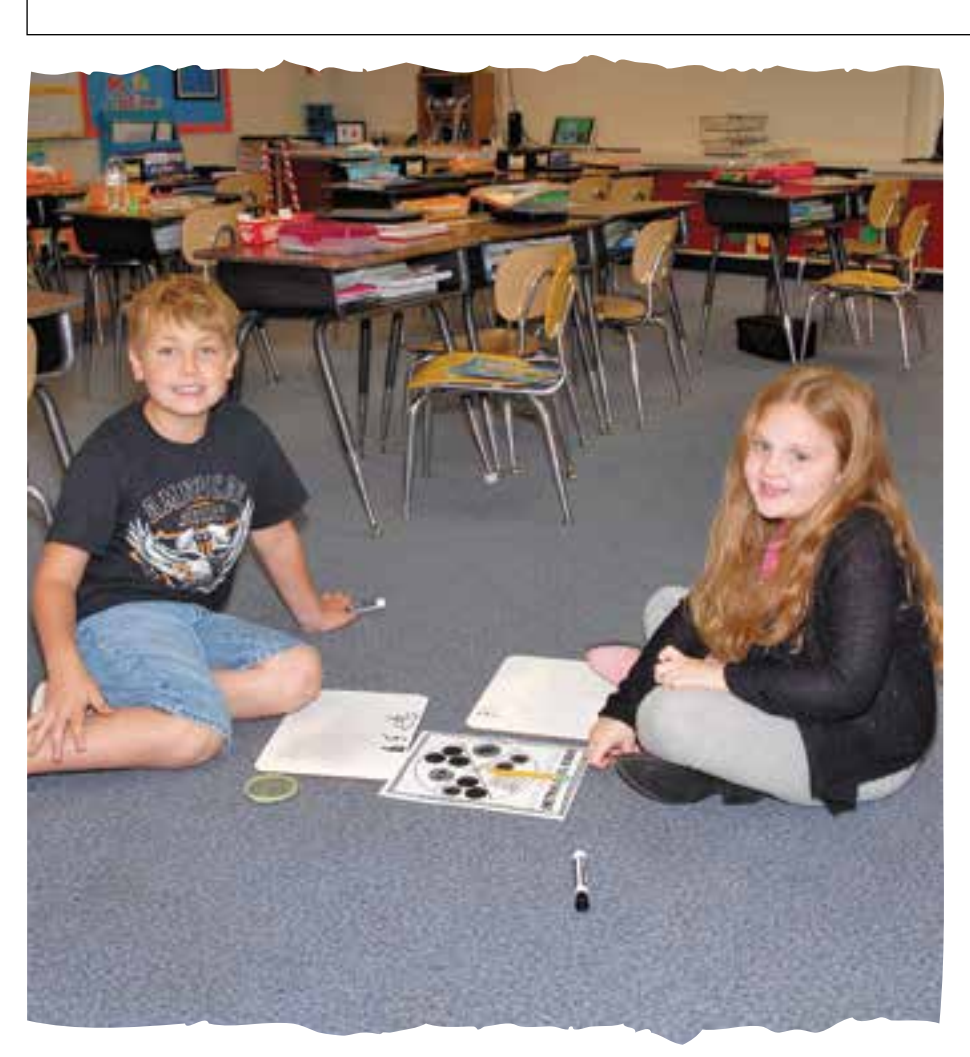
It is a great time to be and become a Bobcat!