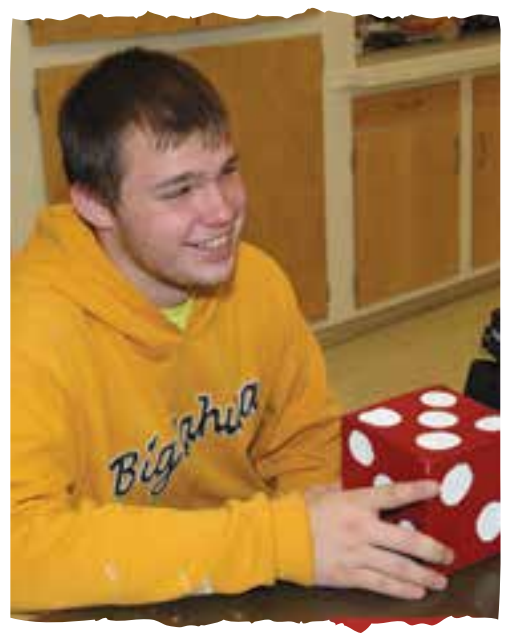
Together, let's finish the rest of the 2015-16 school year strong!