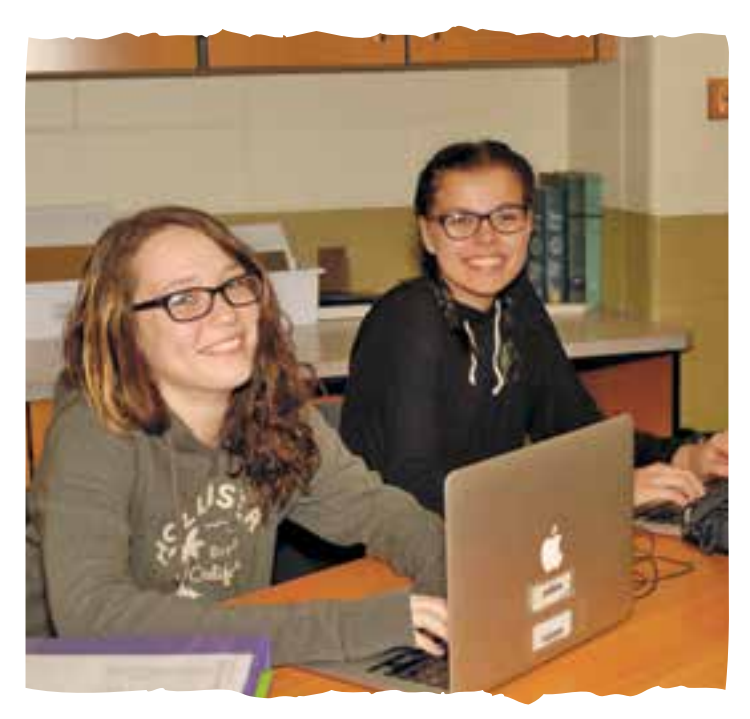
At Oregon-Davis School Corporation, our goal is help students discover new things every day, by enabling them to pursue their full potentials in academics and extra-curriculars.

In 2007, the Oregon-Davis boys and girls basketball teams made history by becoming the first teams in Indiana history to win both basketball state championship in the same year. On Dec. 3, 2016, O-D honored these state championship teams, as well as the 2014 girls state championship team. Many team members were on hand after the junior varsity game to dedicate the newly constructed trophy case at O-D. We are proud of our athletic history!