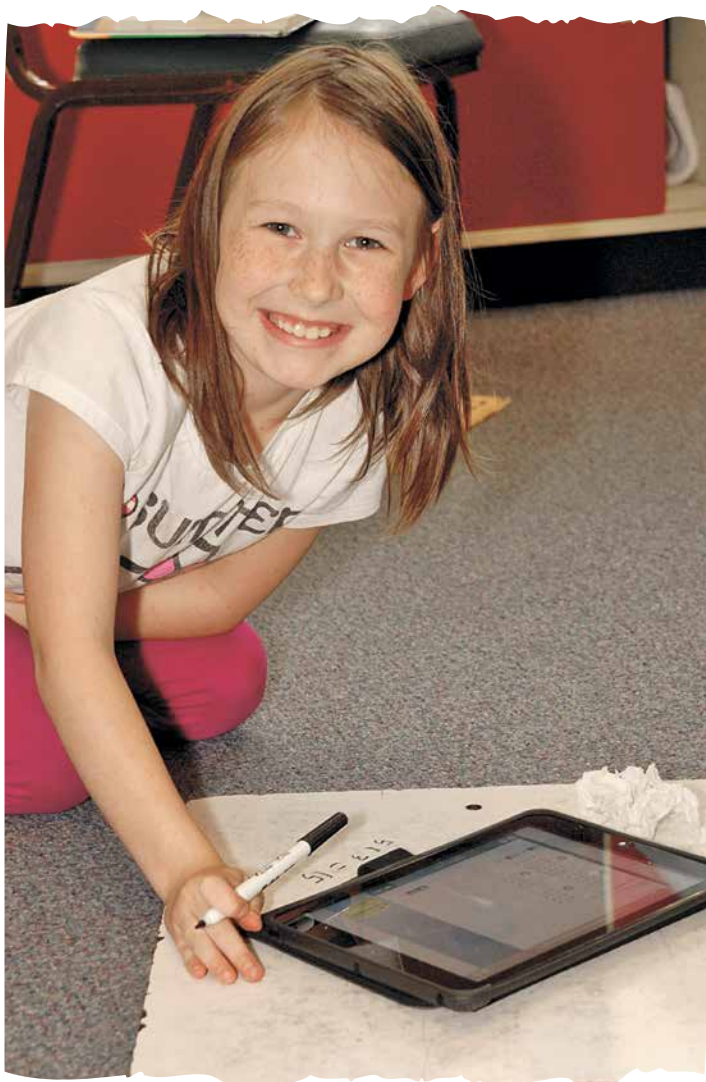
Technology plays an important role in learning at Oregon-Davis.