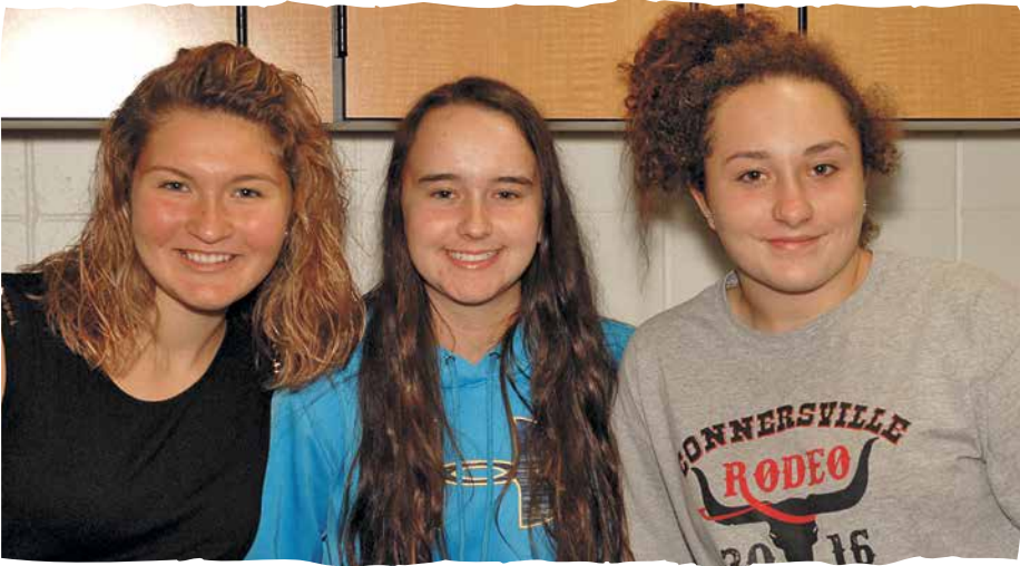
Our students receive a well-rounded education, make great friends and have fun, too!