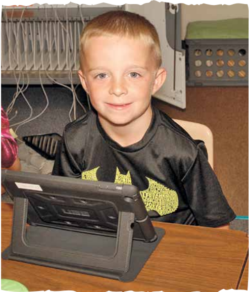
We are looking forward to starting a new school year with success. We hope you are, too!