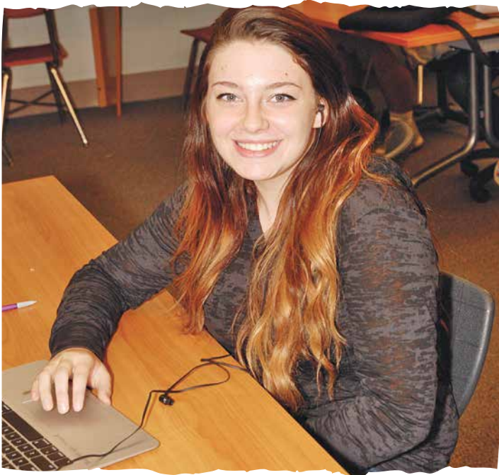
Learning, creating, growing, thriving: this is what we do at Oregon-Davis.